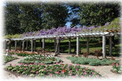
Maymont's Italian Garden