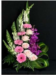
Grouped Mass Design