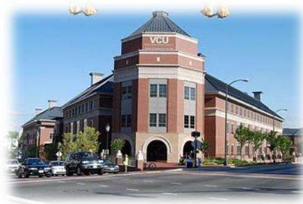
Virginia Commonwealth University